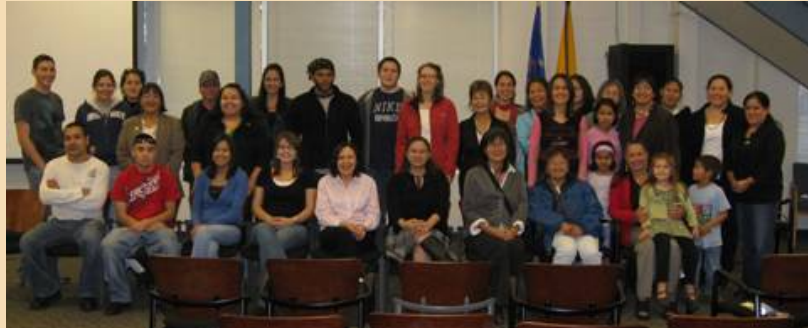
Approximately 40 Doyon Foundation students, alumni, friends and family gathered for a potluck held in Anchorage on September 18.

Doyon Foundation and the Doyon Foundation Alumni Association recently hosted its first event in Anchorage - a potluck for Anchorage-area alumni, current students, friends and family. Approximately 40 people attended the event, which took place at Southcentral Foundation's Gathering Room on September 18.