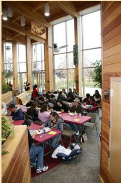
About 60 people attended Doyon Foundation's fall student dinner, held September 27 at the Doyon, Limited Chiefs Court in Fairbanks.