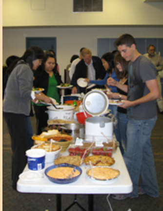
Attendees of the Anchorage potluck enjoyed a range of traditional Native foods.