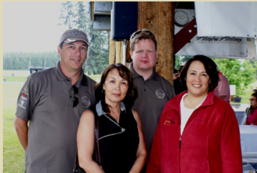
Members of the first place team in the 2011 Morris Thompson Memorial Golf Classic are pictured with Doyon Foundation Executive

For more information, visit www.doyonfoundation.com or contact 907.459.2048 or foundation@doyon.com .